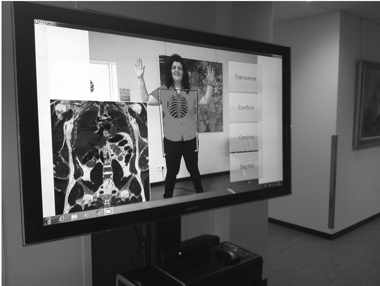
Fig. 2 A screenshot of the magic mirror ‘Miracle’ that augments CT data onto the body of a trainee

costly. And so far, no objective empirical evidence exists concerning the effectiveness of dissection classes for learning anatomy [17].