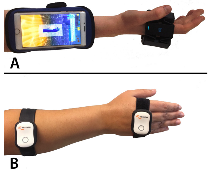
Figure 1 Sensor placement. (A) iPhone and Myo; (B) two Valedo sensors.

obtained using sealed opaque envelopes. Patients are randomised using block randomisation in blocks of four, stratified for age (18–64, and 65 years or above) and for treatment type (conservative treatment using immobilisation or operative treatment by means of internal fixation) to ensure a balanced randomisation into the two groups.