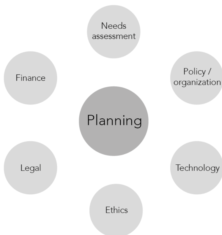
Figure 2. eHealth project progress aspects.