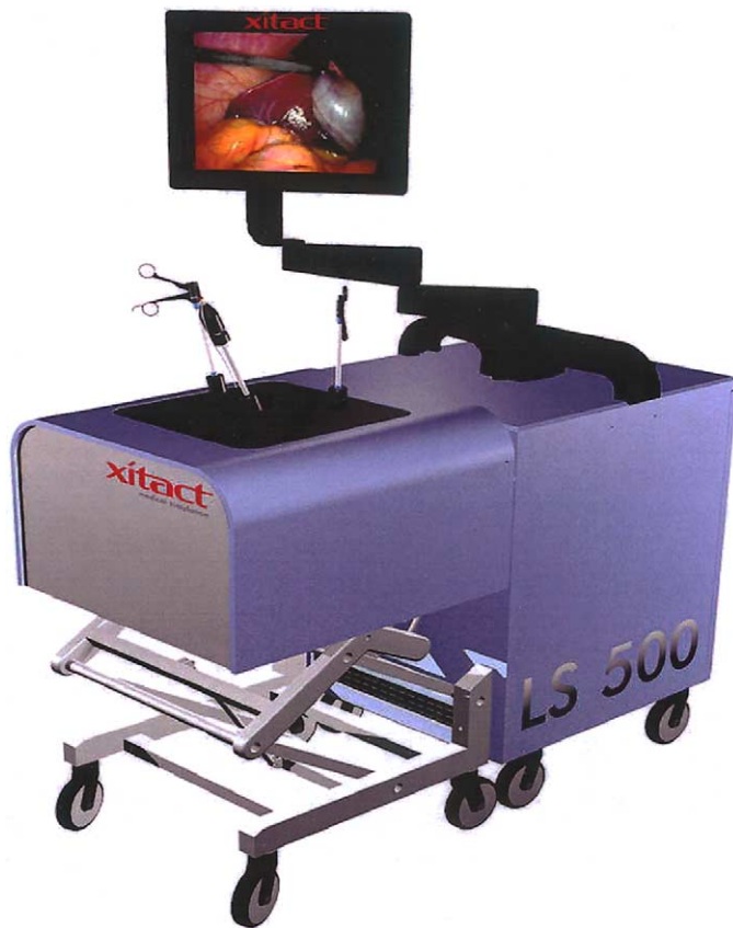
FIG. 1. The Xitact® LS500 laparoscopic cholecystectomy simulator.

Group 4 consisted of performers with a low level of innate abilities, not gaining improvement through VR training (20% of total group).