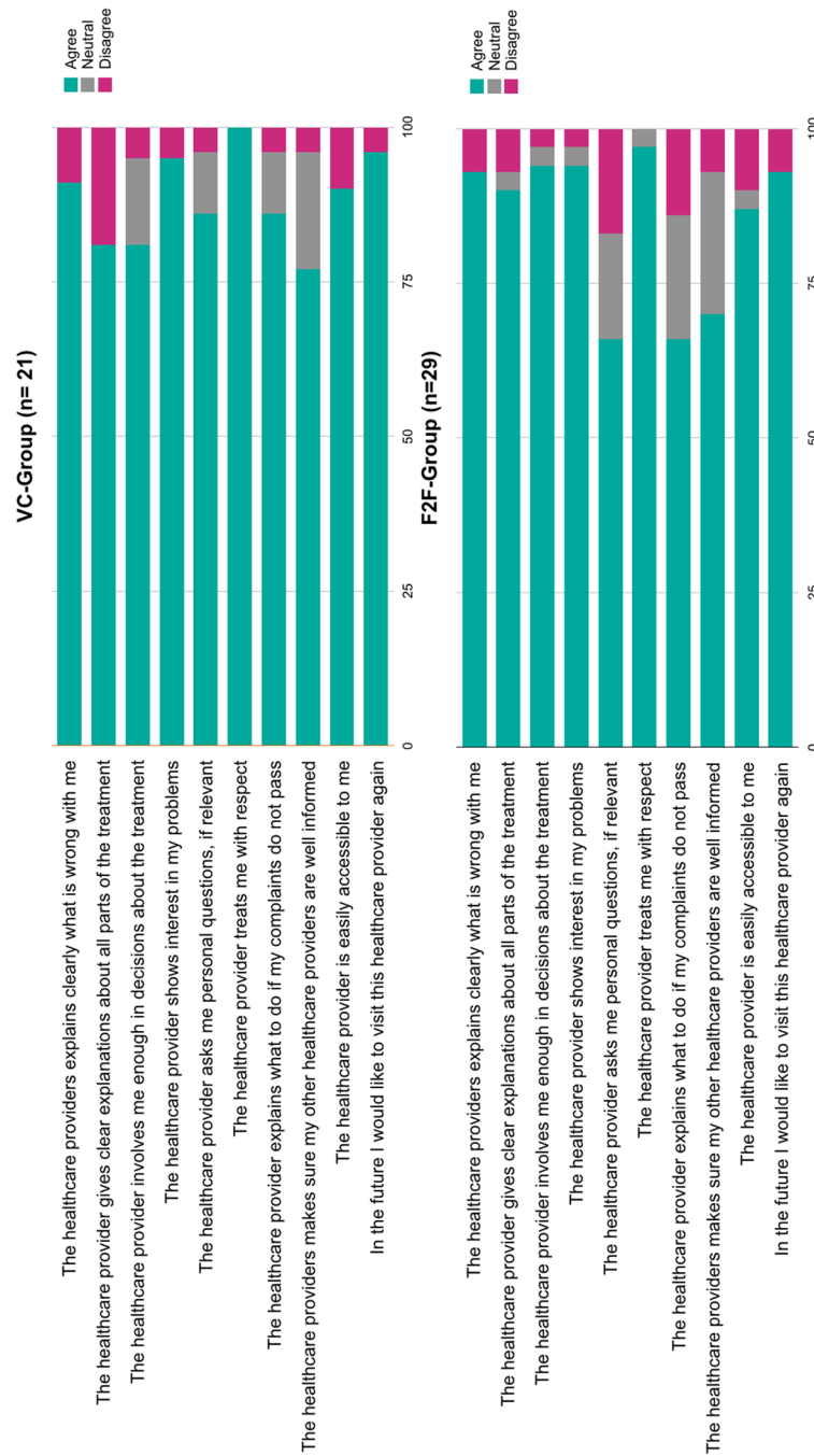
Fig. 4 Results of the Multi Source Feedback Questionnaire completed by patients after the VC or F2F-visit. Answers were provided on a 5-point Likert scale and are presented in percentages. Categories 'Totally agree' and 'Agree' were pooled as 'Totally disagree' and 'Disagree'