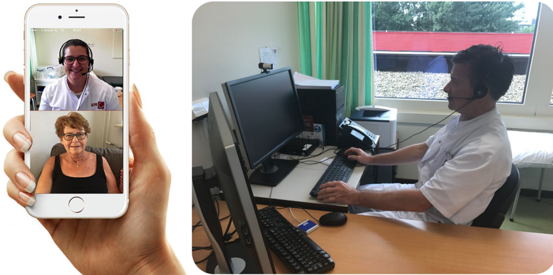
Fig. 1 Audio visual connection on a smartphone (patient) and at the workplace (surgeon). Permission of all pictured individuals was obtained